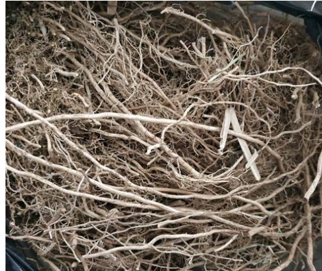
Fig. 1. Half-decomposed vetiver waste fertilizer.

vetiver waste fertilizer. Organic fertilizers have a significant impact to increase growth (See Table 3).