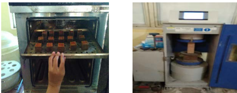
Fig. 4. Preservation and testing preparation.