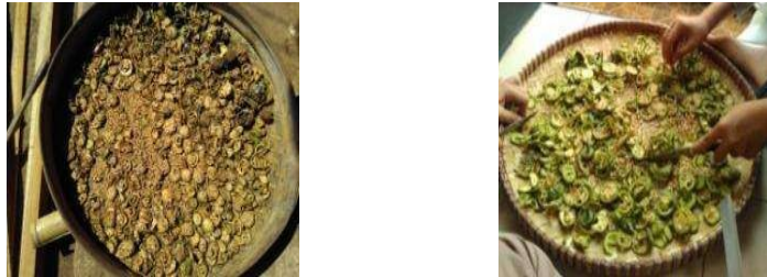
Fig. 3. Powder of kecubung fruits.