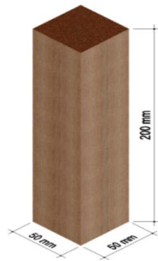
Fig. 2. Size of specimen compressive test.