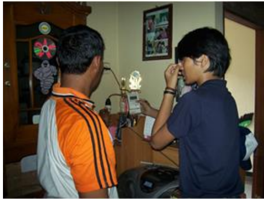
Fig. 2. Household energy consumption survey.

The analysis of operational energy requires detailed data of energy consumption. The data were obtained using interviews (household profile, number of appliances and usage time) and the measurement of appliance capacity by using watt checkers (MWC01, OSAKI) (see Fig. 2). The energy consumption of the household appliances was estimated by multiplying the number of appliances by their usage time and electric capacity. In Indonesia, the primary energy sources consist of 42% of coal, 17% of oil, 28% of natural gas, 10% of hydro and 3% of geothermal as [16, 17]. The consumption of electricity was converted into primary energy by considering the energy mix, transmission losses, and electric efficiencies. The annual average energy consumption was obtained by combining the consumption of all appliances. The unit of gas (LPG) is also converted into energy unit (47.3 MJ/kg) [17]. As previously mentioned, the variation of seasons in Bandung is relatively low. Thus, it is assumed that the usage time of appliances is constant throughout the year. Yet, the changes of air temperature and humidity were taken into account in the calculation of the energy consumption of refrigerators and air-conditioners even though the identified resultant changes were negligible.