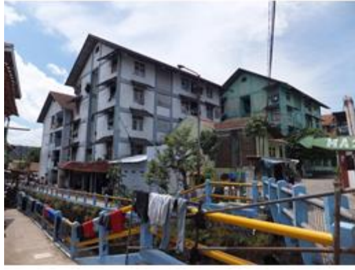
Fig. 1. Public apartments.