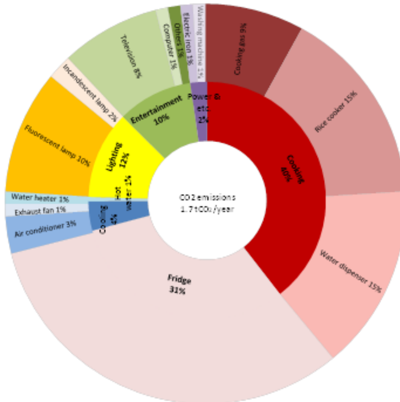
Fig. 5. Annual CO 2 emissions (tCO 2 /year).