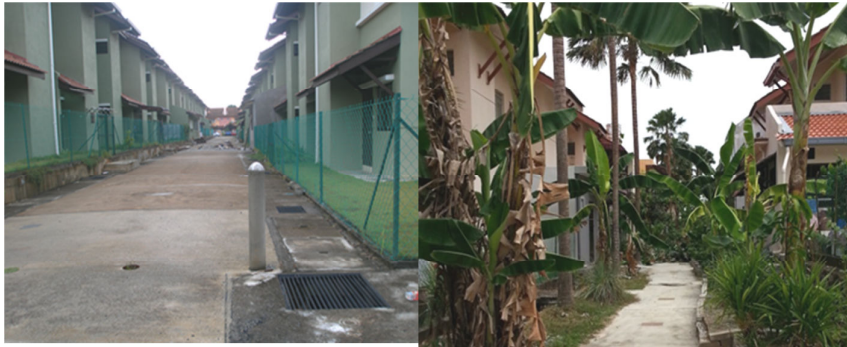
Fig. 5. Pavement Back Lane (PBL) design of Bakawali B (left) and Landscaped Back Lane (LBL) Bakawali C (right). Pavement Back Lane (PBL) is clear and plain for easy maintenance but lacking of visual privacy among dwellers.