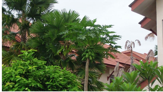
Fig. 4. Fruit Trees and palm trees planted at Landscape Back lane (LBL) act as buffer and lessen view. It assists to increase visual privacy of occupants.

Both of the group agreed that the back lane width have direct associated to their privacy. The wider the back lane, the greater their privacy level. The wider back lane means that the distance between row of houses are increase.