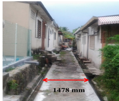
Fig. 1. Narrow width of back lane in terraces houses in Seremban, Negeri Sembilan completed in 1984 [7].

Ahmad Hariza [19] from their findings indicates most muslim women wished for more visual privacy from adjacent neighbors. They feel uncomfortable zone due to size of windows, narrow back lane width even sometimes they can see their opposite neighbors. As Muslim women they have to take care about the aurat from non- mahram . Muslim women must cover their whole body from men excluding their mahram (father, husband, children and brothers) except their face and hands. As the back of the house is too close to the neighbors, they can see each other directly and it is sometimes inconvenient they experience no privacy even in their own house (Figures 1-2).